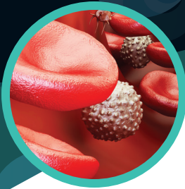
◀ Red & White Blood Cells

No longer reserved for professional athletes and the 'Hollywood elite', Bone Marrow Concentrate (BMC) is fast becoming the treatment of choice for everyone.