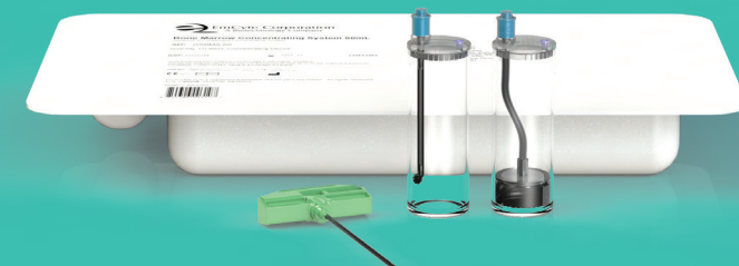
Bone Marrow Concentrating Kit. ▶

The area of extraction is locally numbed so pain is minimal. Bone marrow is extracted from the back of the patient's pelvis from an area called the posterior iliac crest. A suctioned syringe attached to a long needle is used to reach the posterior aspect of the hip. The collected sample is transferred through a filter into a specialized device which is then placed into a centrifuge. Spinning at over 3000 revolutions per minute, the platelets and stem cells from the bone marrow sample are now separated and concentrated. This concentration of stem cells and healing components, collectively known as the bone marrow concentrate are reintroduced to the injured area.